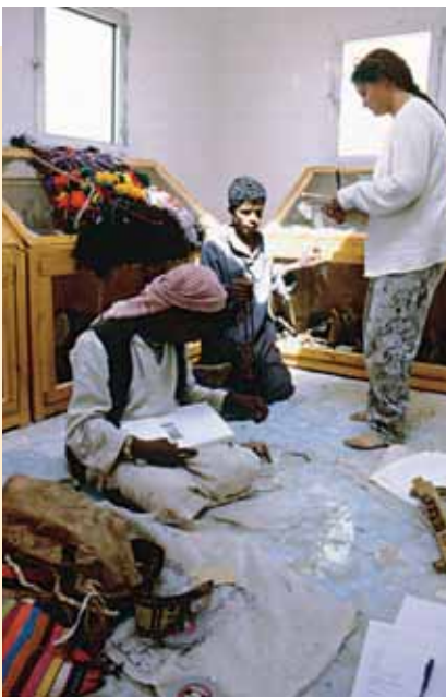
Figure 5 Ababda describing the EDAPP collection

The fact that the natural, ecological and the social