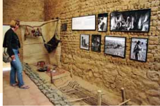
Figure 2 Ottoman fort exhibit at Quseir

future. The Ababda asked for help in documenting their lifestyle for their children and the rest of the world. This resulted in several activities, initiated by the Ababda, to record and preserve Ababda traditions.