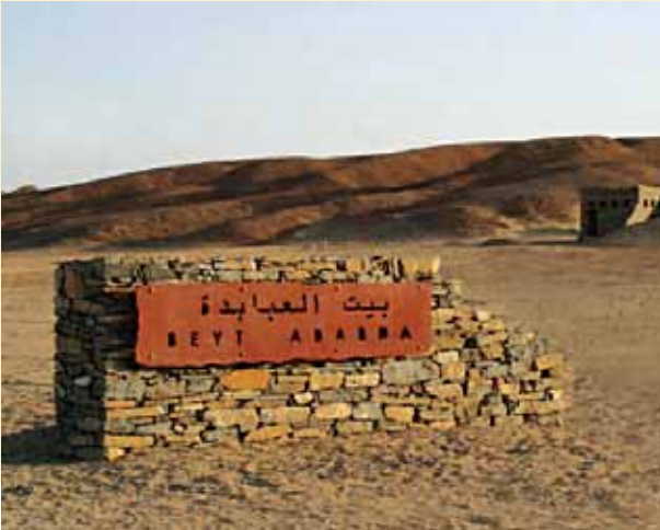
Figure 1 The Beyt Ababda