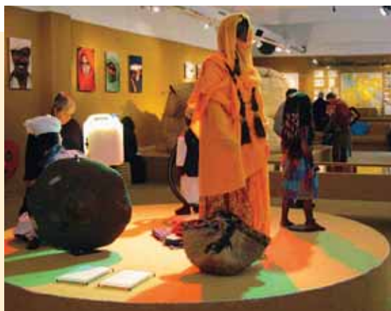
Figure 3 Wereldmuseum Rotterdam exhibition

With the onset of large developments in the area, the