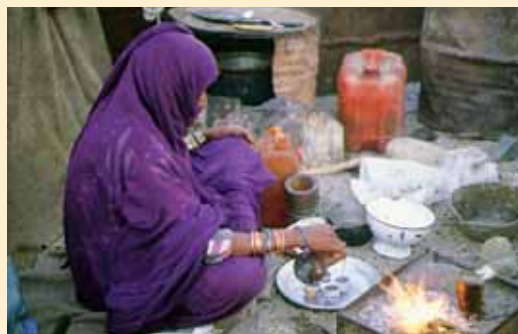
Figure 7 Information about the Ababda in the Map House