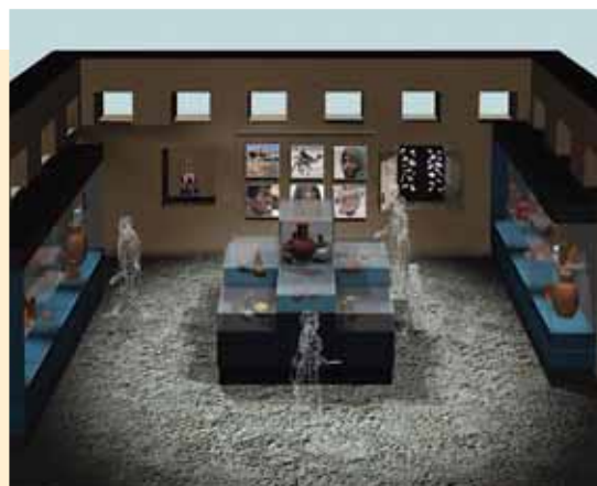
Figure 4 Interior design of the Beyt Ababda