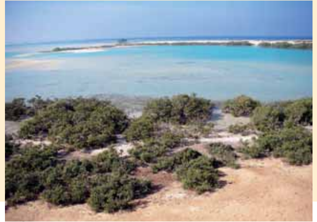
Figure 8 The mangrove reserve at the Red Sea shore

second place on the female side were things relating to personal adornment and to the traditional house, the beyt bursh . The Ababda live in mat houses called beyt bursh that can be compared to other nomadic traditions in north and east Africa, such as the Tuareg and the Affar.