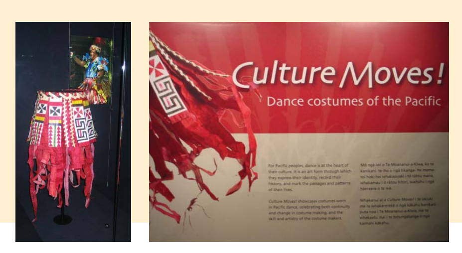
Figure 3(Left): Tuvalu skirt Figure 4(Right): Exhibition introduction label graphic

to make a whole, and the costume from Tuvalu, of which we only had the skirt. The Tuvalu skirt was used as our main 'signature' graphic for the exhibition (Fig 3 & Fig 4).