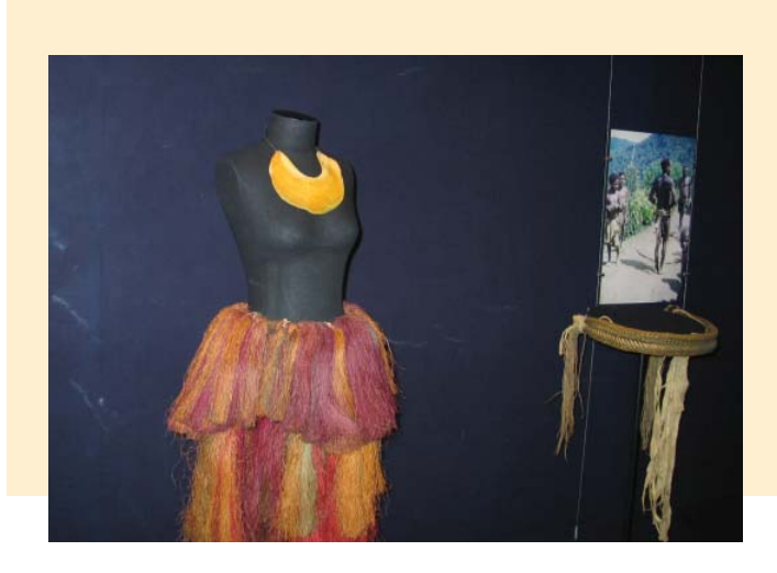
Figure 1: Dance skirt, dance belt and breast plate

http://www.hawaii.edu/cpis/dance/about.htm).