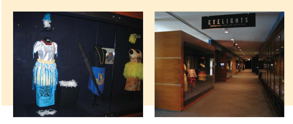
Figure 6: Tongan, Niuean and Samoan dance costumes worn at Polyfest. Figure 7: Layout of the exhibition space.

that we documented and acquired ourselves. The next step is to work out the logistics of how intangible forms of expressions can best be represented in Te Papa's Pacific Collections and most importantly to validate its inclusion within Te Papa's Collection Development Policy.