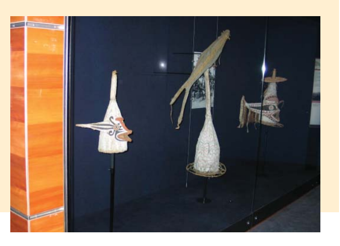
Figure 2: Eharo masks

For the duration of the conference, Te Papa was temporarily a living space of living treasures, in terms of the wealth of knowledge and experience that each participant contributed. One of the discussion panels in the conference looked at documenting dance, exploring questions of why dance should be documented and how may it be stored and recorded in an institutional context, and what type of relationships are possible between dance communities and people who document them. Some of these questions were explored in the development of Culture Moves! Dance costumes of the Pacific.